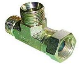
TE TUERCA LOCA LATERAL