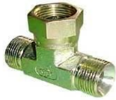
TE TUERCA LOCA CENTRAL