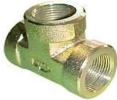
TE HEMBRA FIJA